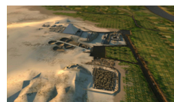
Overview of the construction of the Great Pyramid. (© Dassault Systeme)