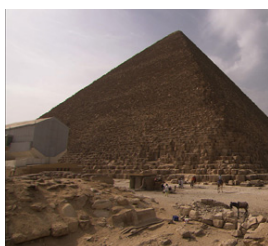
The great pyramid of Khufu

Check the upcoming events in the section "Agenda" or Order a personal workshop in a location of your choice